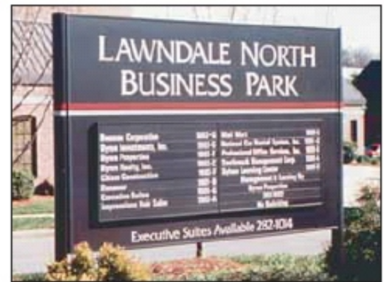
DP SERIES - CUSTOM

Custom sizing available. Please call. Copy in addition to prices shown. See vinyl letter price list below.