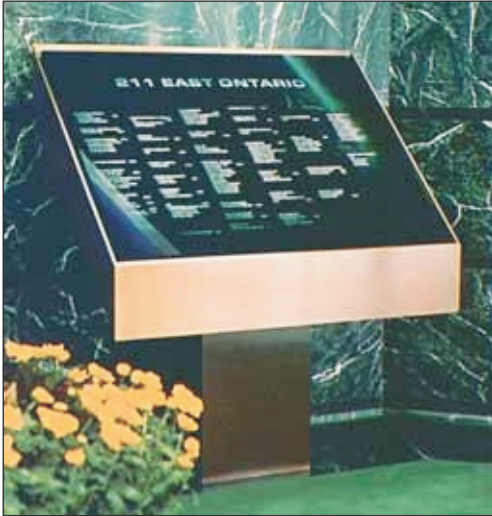
Optional Brass Finish & Pedestal

Extruded clear finish aluminum framing with frameless PPG Greylite 14 polished edge glass door. The glass creates the floating effect of the lettering only showing through.