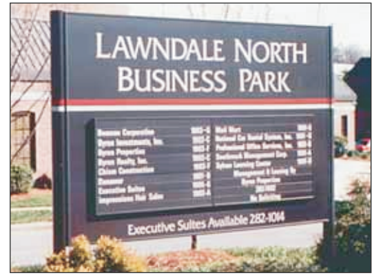
DP SERIES - CUSTOM

Custom lettering and logos available. Please call or write for prices.