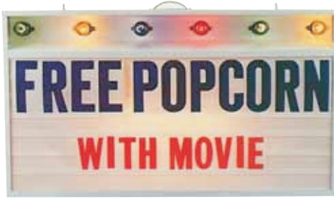
Model #1 CL

Blinking marquee style sign is a real attention getter. White metal case with white reader board face. Accepts 2", 4" and 6" letters. Six flashing colored 11 watt bulbs at top and two 60 watt to light the copy section. Unit is complete with 2" and 4" letters 345 pieces total. Ships UPS 32#.