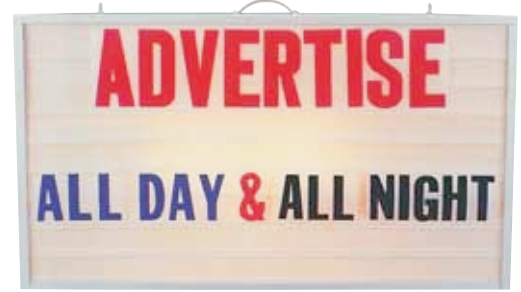
Model #6 CL

Horizontal or Vertical style blinking window signs. White metal case with white reader board panel. Panel is backlit with two 60 watt bulbs that operate in fixed or flashing mode. Model 6CL is complete with 2", 4" and 6" letters, 550 pieces total. Model 13CL has 2" and 4" letters, 550 pieces total. Both ship UPS 30# each.